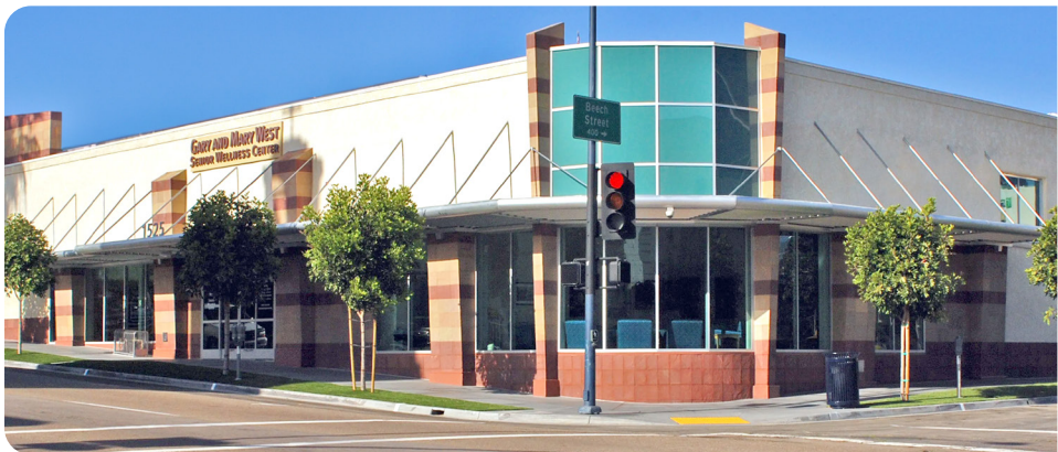
Gary & Mary West Senior Wellness Center

Each year, we provide over 1,100,000 meals and coordinated services to thousands of older adults aged 60 and above, most of them living on less than $1,200 per month.